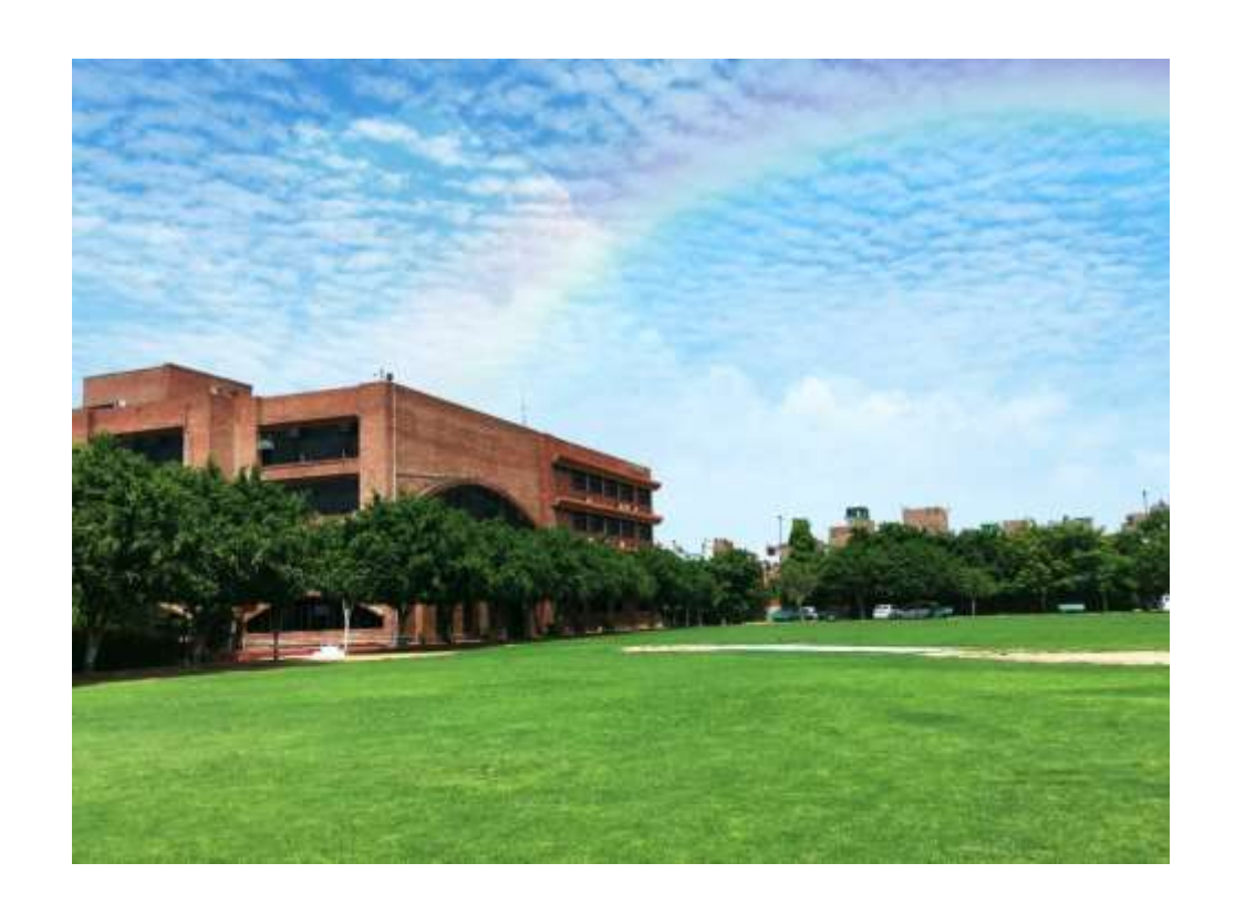
Clean and Green Campus of BVIMR