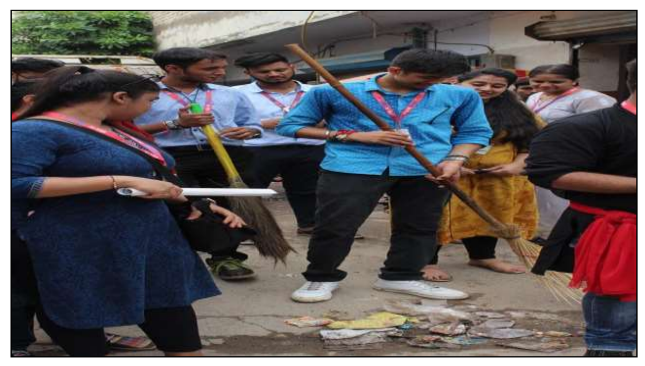
BVIMR Students participating in cleanliness drive at MundkaVillage