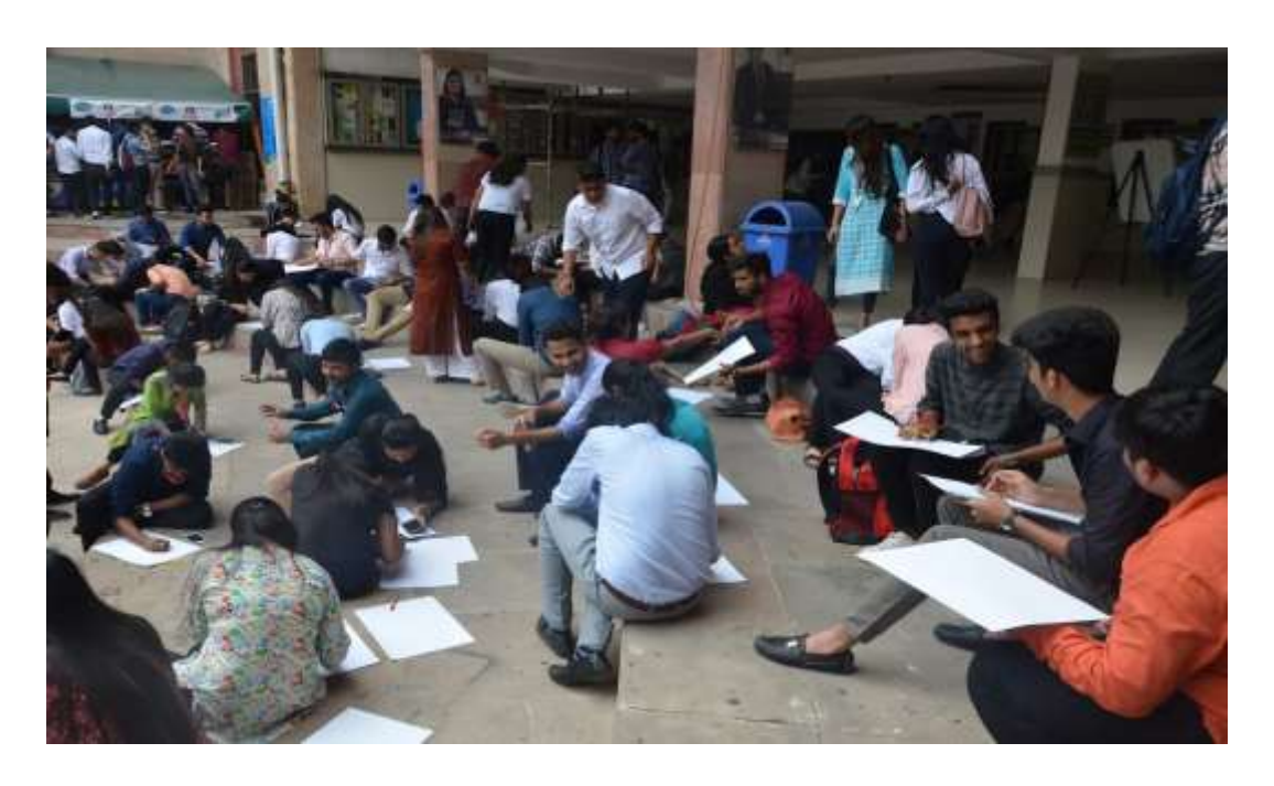
Students Participating In Poster Making Competition

India to be approximately 10 lakh with around 15000 fresh cases added every year, often as a result of f alls, road traffic accidents, diving injuries, etc. It generally affects the lower socioeconomic status popula tion. As per one Indian study, 79% of SCI patients are from rural areas, with an average monthly income of INR 3000. After the session got over, students were given the opportunity to take part in Poster Competition in which the topic was "Stop SCI and Health Talk" wherein the entries were submitted to ISCOS.