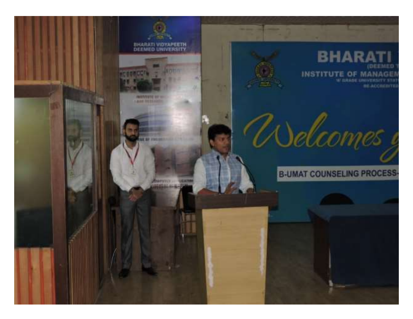
Guest Speaker addressing the students during MBA Orientation

Overall orientation program was successful and really helpful to all the students who came with great expectations from different colleges from across country.