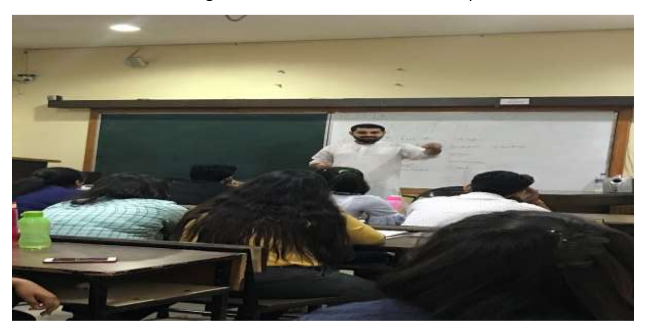
individual uses a technique, such as focusing their mind on a particular object,

For being a good entrepreneur we should adapt with the changing environment, we should know our USP. Every person has something unique in him we just have to identify it and work on it. We must have a good intuitive power, which could only be attained by relax mind as relax mind attains more focus, and relaxation could be achieved through meditation. Meditation is a practice where an