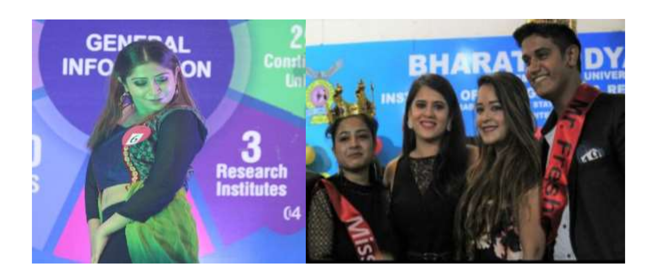
Winners of the Event with Judges