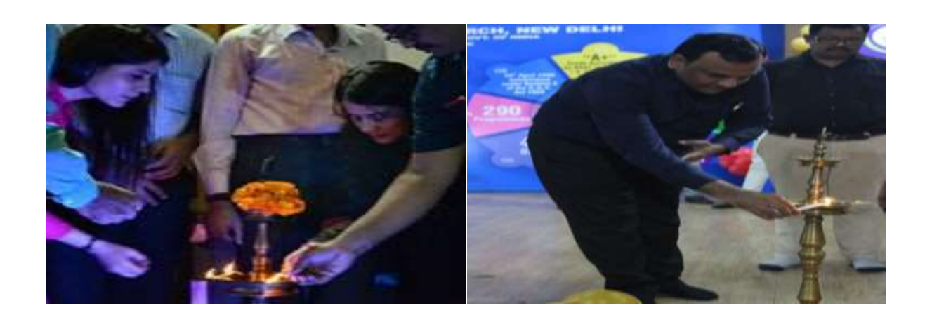
Faculties Lightning and Inaugrating the event