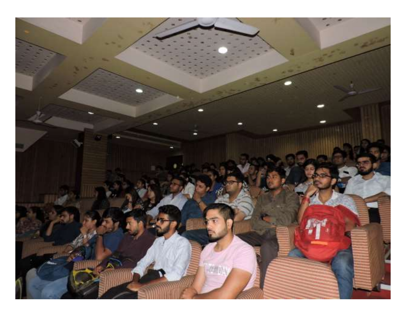
MBA students attending the orientation program