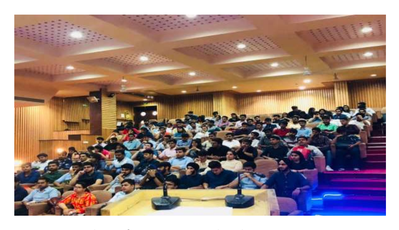
Students of BBA & BCA attending the session on ERP

grade points, standard of passing, criteria of award of degree, examination calendar. He also discussed about the summer internship training of 50 days to be done in the last year. Also, he briefed the students about the placement opportunities in the campus and outlined the different aspects that will explain the overall personality pattern and etiquettes that will pave the way for overall success in their future endeavour. He told them that BVIMR, New Delhi has the culture of inviting corporate honchos for delivering the corporate ethos that are underlying in their corporate units aimed towards the holistic development of the students and industrial orientation. He ended the session by welcoming the entire fresher's again and giving best wishes to them.