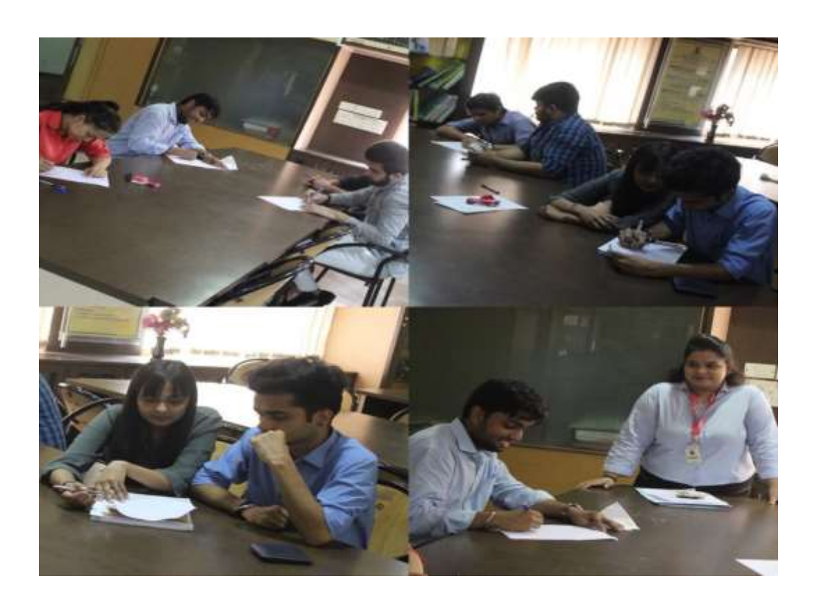
Students participating in Essay writing competition

The event was held in the college library. The topic for essay and article writing was clean and green India and the word limit was from 150 words to 200 words and the time limit was 30 mins. Sheets were provided by the college.