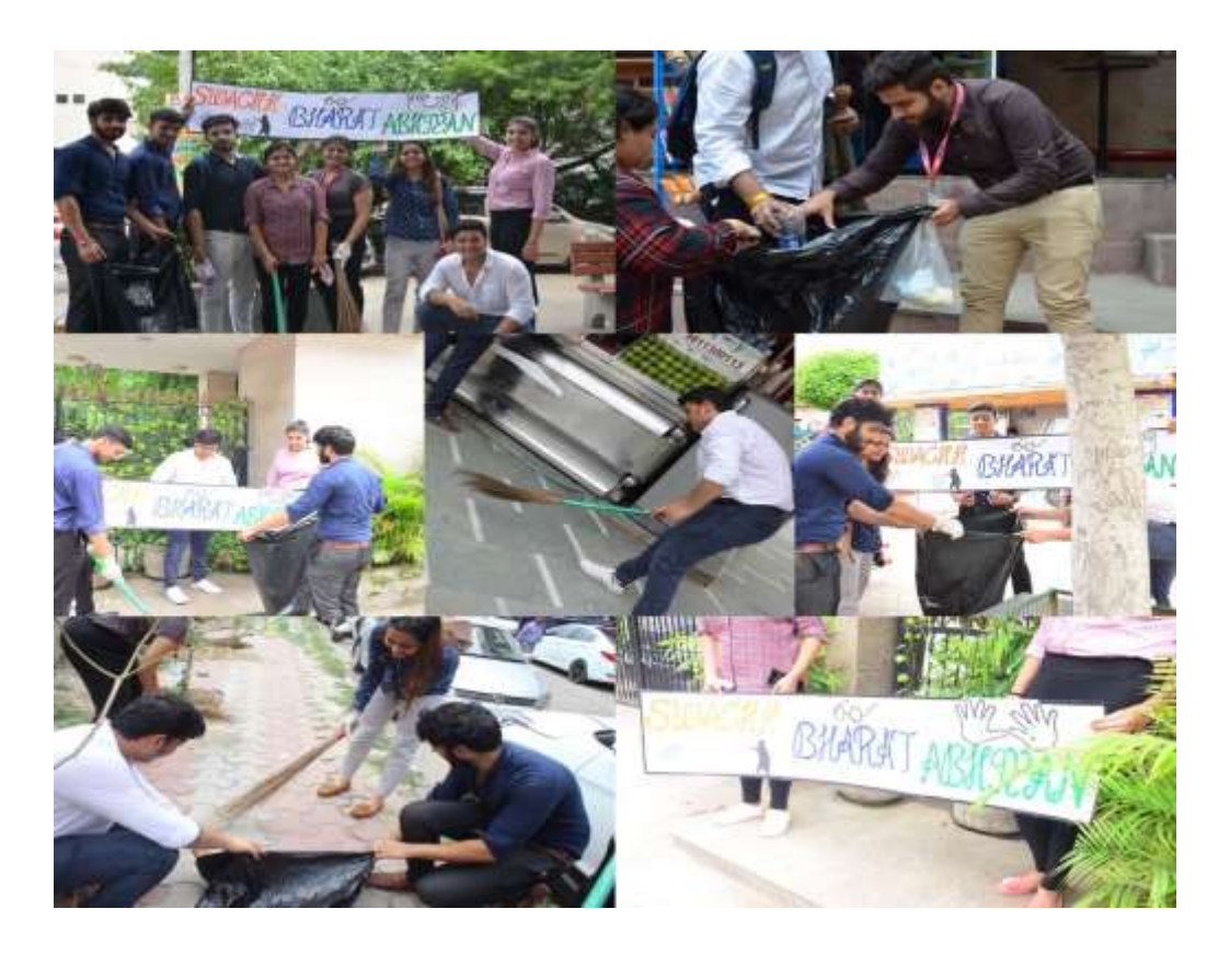
Students during cleanliness drives