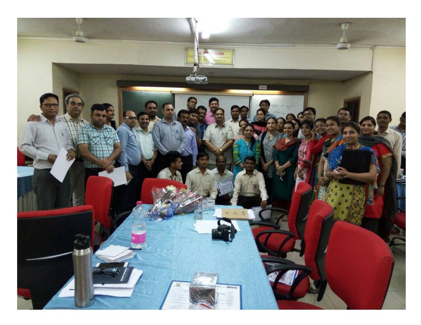
Figure 16- Final Day, FRP'16 (B.V.I.M.R Family)