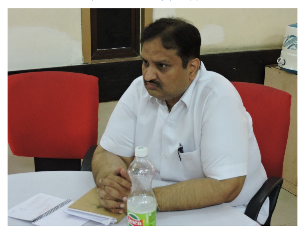
Figure 10- Hon'ble Director Sir focusing on presentations by Faculty members