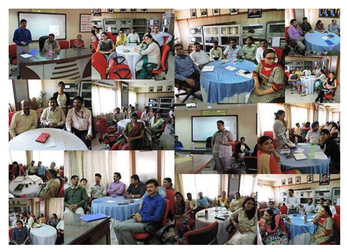
Figure 3- First Day of FRP'16