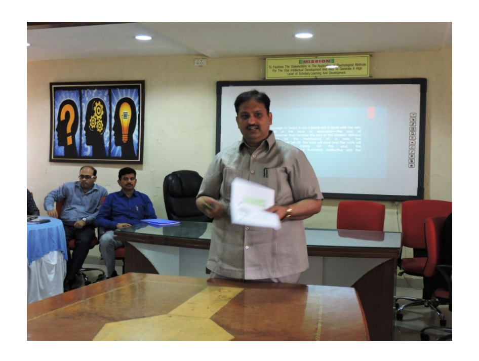
Figure 2- Hon'ble Director; Dr. Vikas Nath's inaugural session