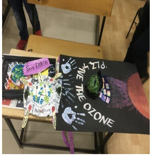
Students participating in the Pep-Art competition where students showed their innovative and creative skill