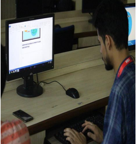
Students showing their creative skill in making green greetings card, Digi-Card