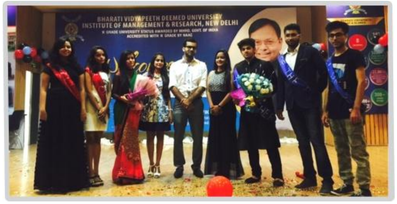
Students of BBA & BCA First Year celebrating Fresher's Day along with Judges