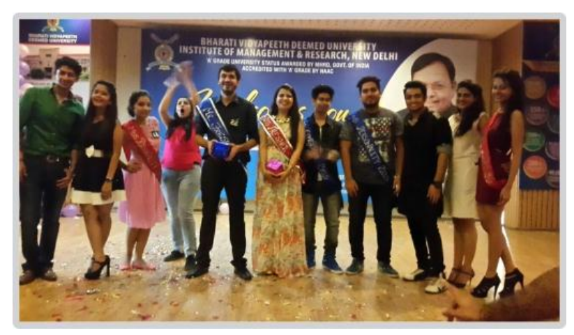
Students of MBA celebrating Freshers Day

After the competitions, it was for the fresher's and seniors to rock the fresher party with dancing and grooving at DJ session in Amphitheatre. The event was a huge success and the fresher's thanked their seniors for such a sumptuous welcome.