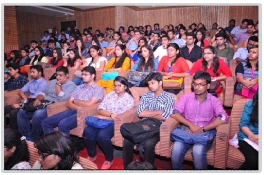
MBA Students learning the nuances of Corporate Life during the Orientation Session