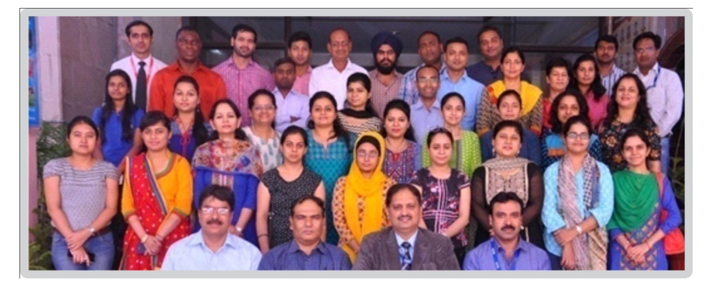
Group photo of the participants of the FDP