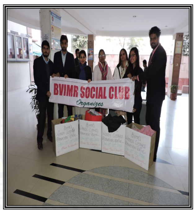
Students of Social & Eco Club conducting Woollen Clothes Donation Camp from 13<sup>th</sup> -26<sup>th</sup> January 2016

In this 11 day camp, Social & Eco Club was able to collect 48 Sweaters, 45 jackets, 50 pants, 5 pairs of shocks, 13 shawls, 26 pairs of shoes and other winter essentials. The student members of BVIMR Social & Eco Club would distribute all the collected woollen cloths to the poor street baggers near the traffic lights around west Delhi (Punjabi Bagh, Paschim Vihar).